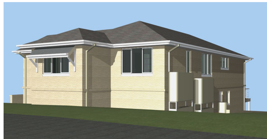
VIEW FROM WHITTAKER ST.